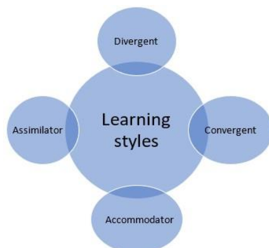
Figure 1. Learning styles